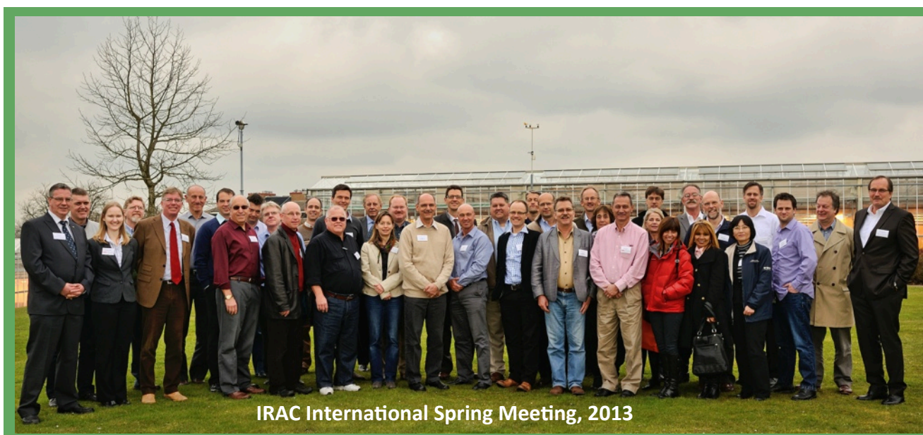
IRAC International Spring Meeting, 2013

Presentations from the ‘International Day’ can be found on the IRAC website Resources Page