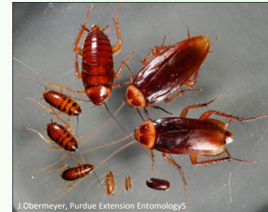
J. Obermeyer, Purdue Extension Entomology5

Although resistance in German cockroaches is widespread, different application methods (e.g. baits and sprays) using different modes of action classes rather than insecticides from within the same IRAC mode of action group should be used in a rotational strategy to provide control and delay the rapid development of resistance in all species.