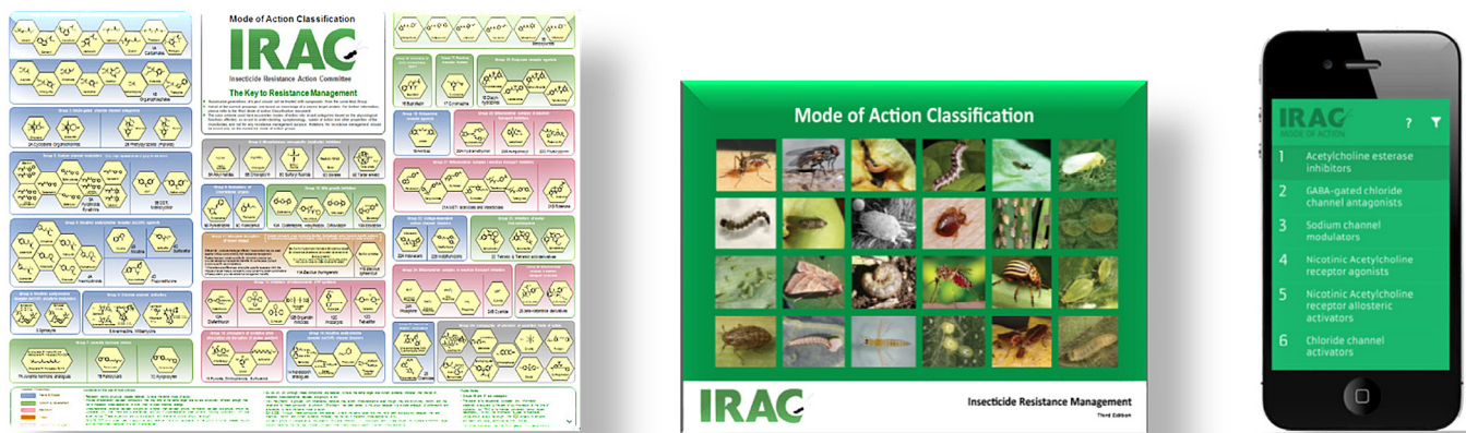
Fig. 3. Different formats of the MoA classification scheme available on the IRAC website include posters, a mini-booklet and a smartphone App.

The MoA Classification scheme is based on the best available evidence for the target-sites or MoA of currently available insecticides and acaricides (currently excludes nematicides). Details of the listing have been reviewed and approved by internationally recognized academic and industrial experts in insecticide toxicology, resistance and MoA. Currently the MoA Classification encompasses more than 25 different MoAs. A condensed listing of the chemistries currently covered by the MoA Classification is presented in Table 1; a more comprehensive listing is available on the IRAC website ( http://www.irac-online.org/ ). In addition to data from the IRAC MoA classification scheme (main group and primary site of action, chemical subgroup/exemplifying active), Table 1 also provides additional information on the total number of compounds in each group/subgroup, the year the first compound in the group was introduced, and the 2013 end-user market value [24] for that group or subgroup.