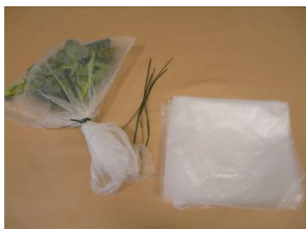
Fig. 1b: Preparing pollen beetles before shipment to the laboratory for testing