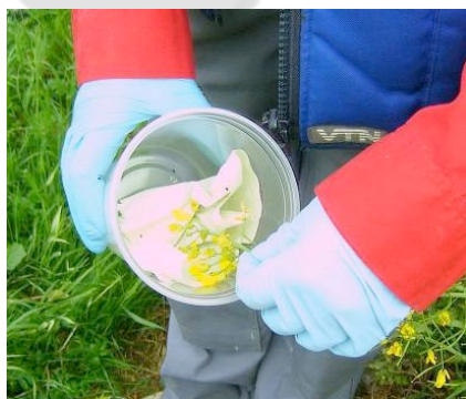
Fig. 1a: Collecting pollen beetles in an oilseed rape field