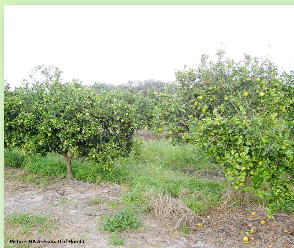
Fig. 1: (a.) Adult of D. citri feeding on a young orange leaf. (b.) HLB infected trees: asymptomatic (left) and symptomatic (right). Notice fruits on the ground, leaf coloration, and dieback are more prominent on the symptomatic plant

Citrus psyllids lay their eggs on the inner-side of unfolding leaves which protect the eggs and early nymphs from adequate insecticide contact, rendering applications of non-systemic insecticides inefficient to manage nymphs. The psyllid nymphal stage has 5 instars taking between 15 and 47 days to become adults depending on environmental conditions. Nymphs acquire the bacteria and the adults vector the disease to uninfected plants and to plants that are already infected, increasing the bacterial titer in already diseased plants. Adults are considered to be the preferred target for foliar insecticide applications since they vector the bacteria. Systemic soil insecticide target nymphs and adults for the first 2 years after planting, after that period, trees are too big for the current chemistries to be effective.